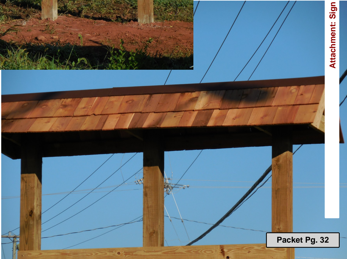
Attachment: Sign Pics (2027 : Colt Bradley - Eagle Scout Project)