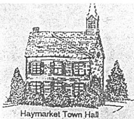
Haymarket Town Hall