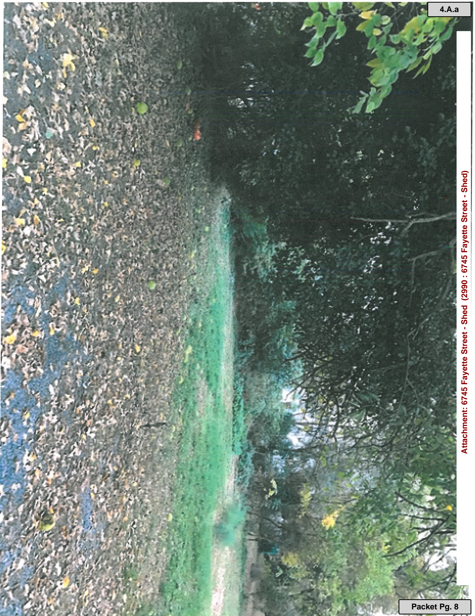
Attachment: 6745 Fayette Street - Shed (2990 : 6745 Fayette Street - Shed)