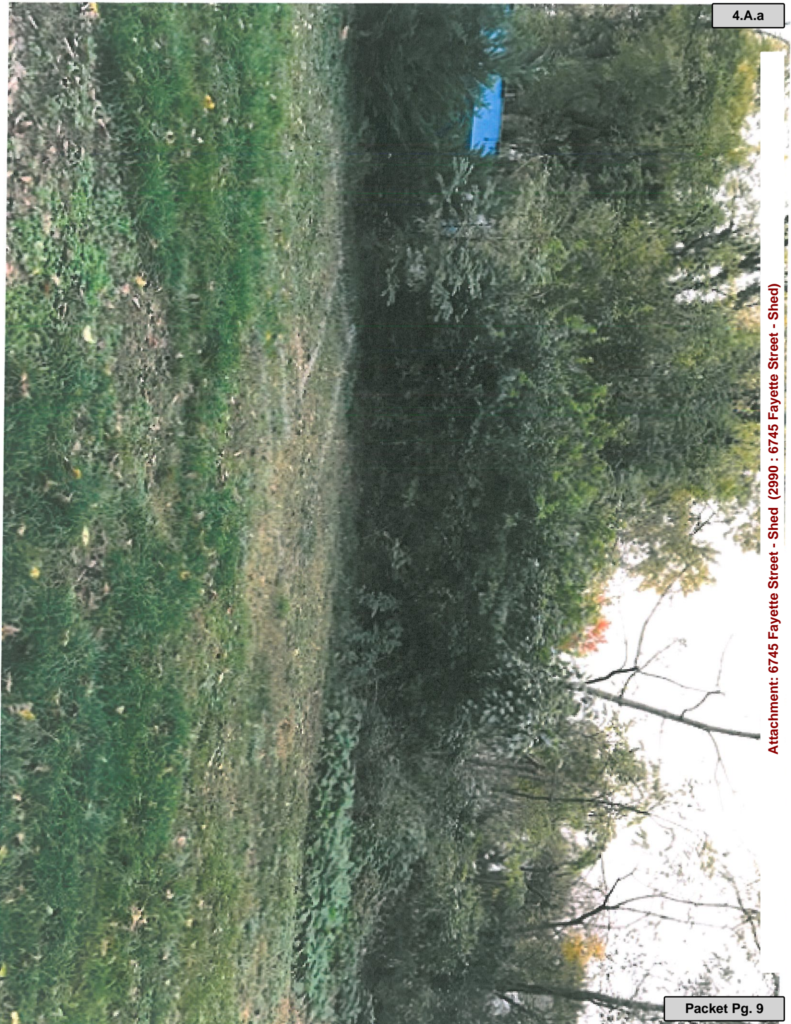
Attachment: 6745 Fayette Street - Shed (2990 : 6745 Fayette Street - Shed)