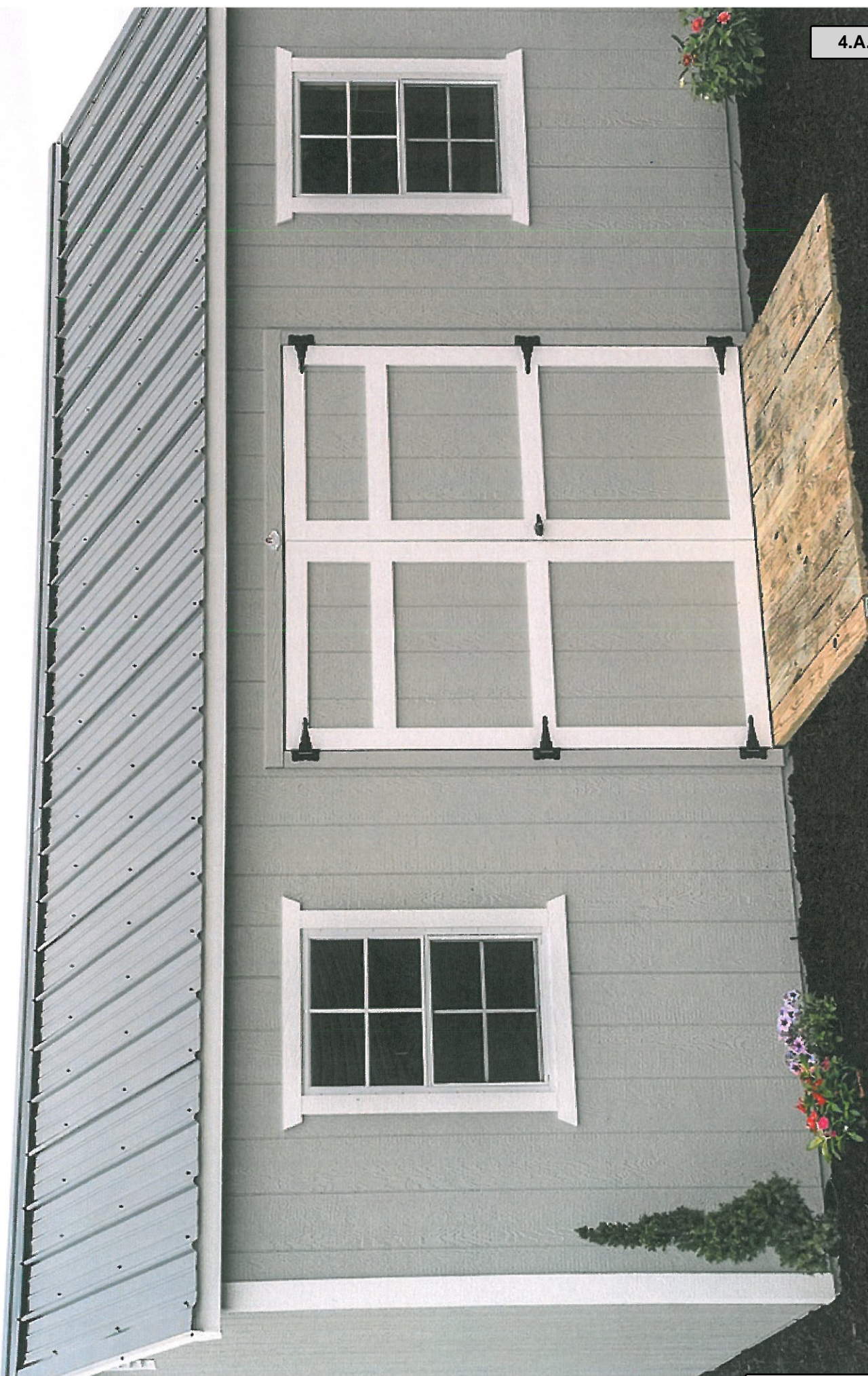
Attachment: 6745 Fayette Street - Shed (2990 : 6745 Fayette Street - Shed)