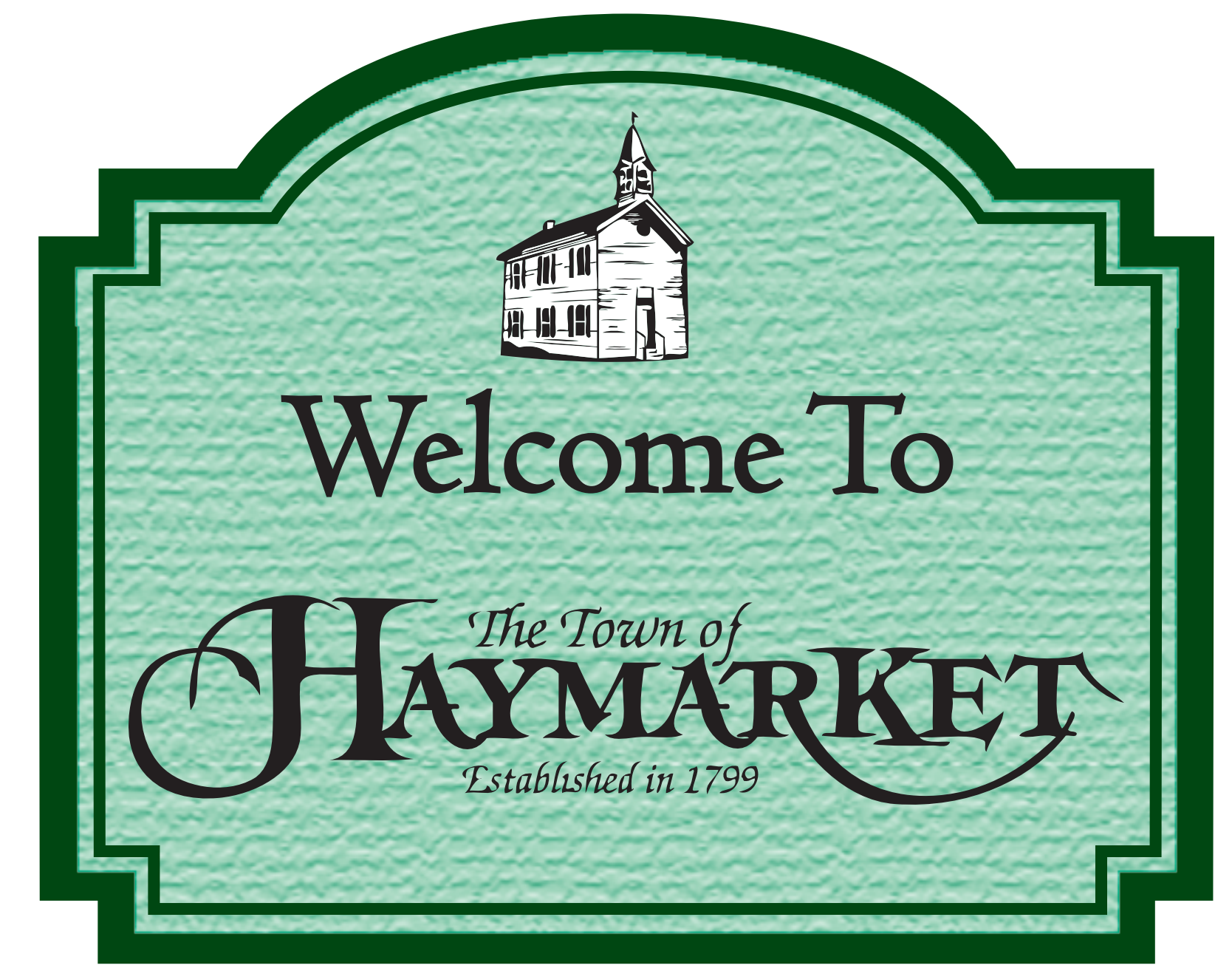
Background is simulated wood grain