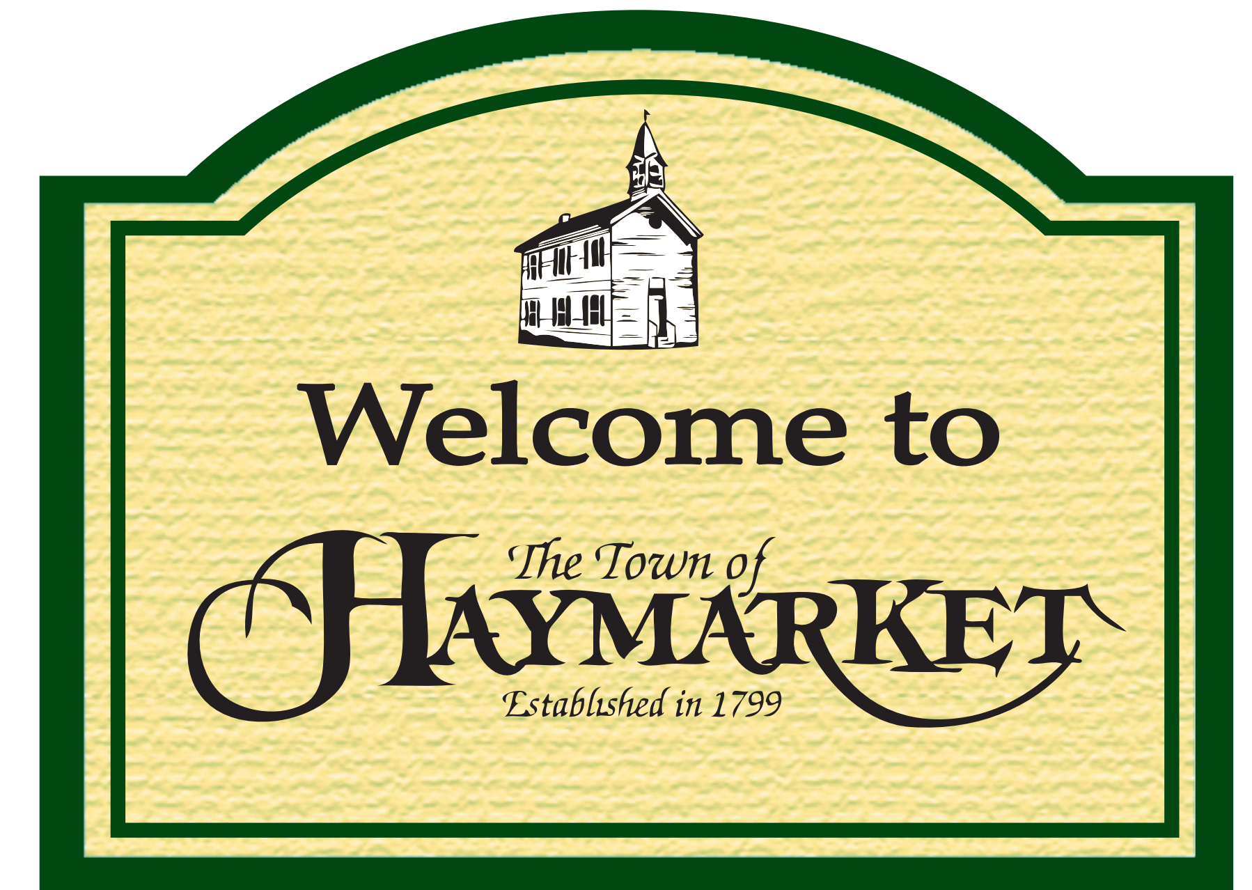
Background is simulated wood grain