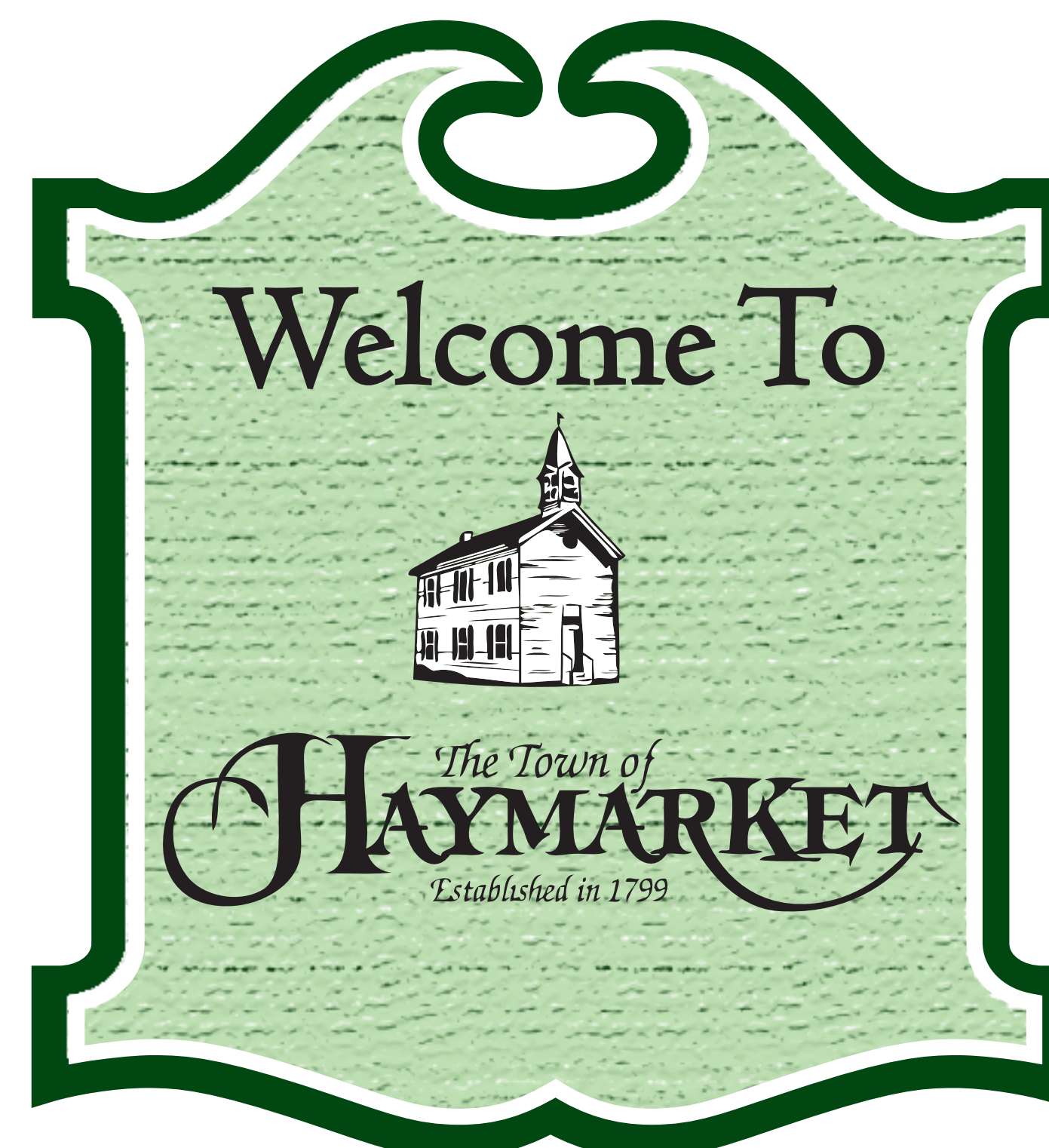
Background is simulated wood grain