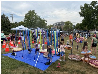
National Night Out!