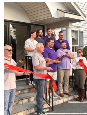
Welcome Skyline Financial Partners! 6611 Jefferson St, 201 571-248-9972