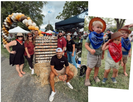
Summer Concert '24